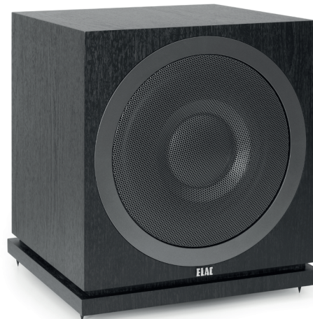
Debut SUB 3010