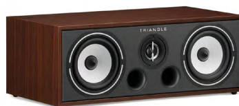
BRC2 349€ (piece)