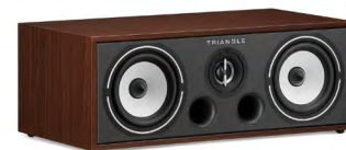
BRC1 275€ (piece)